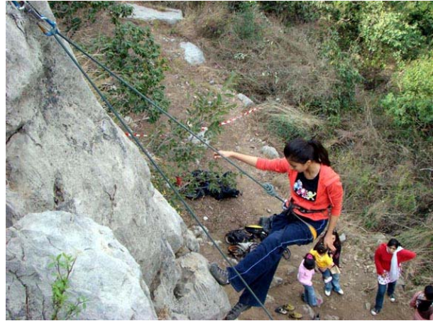
Training - Descending