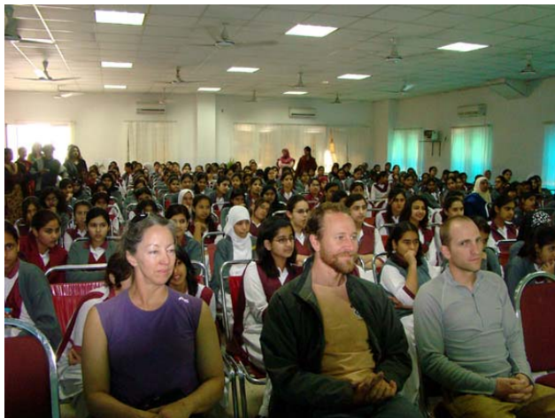
Lecture at City School