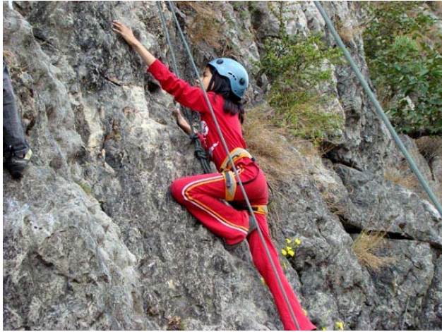
Training - Climbing