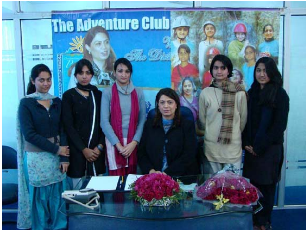
Formal Announcement by Senator Nilofar Bakhtiar