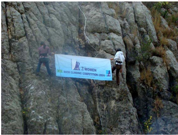
Formal Opening with Flag