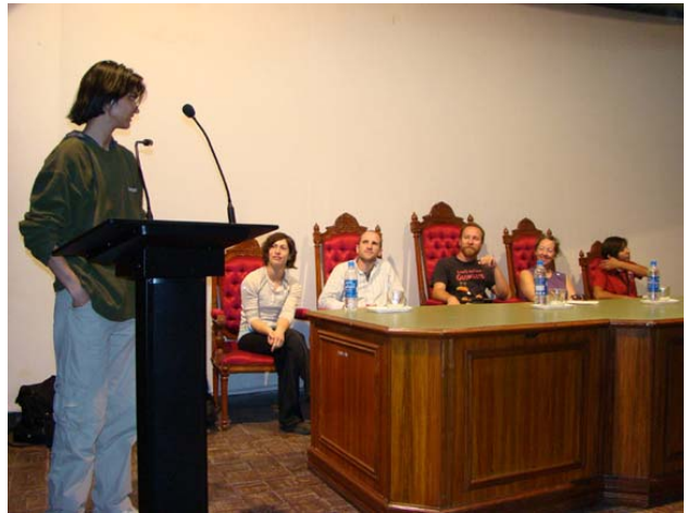
Lecture at FJWU