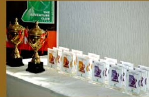
Special Award Best All Round Performance