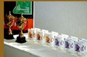
Special Award Best All Round Performance